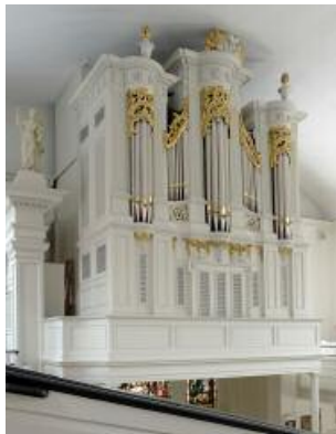
St. Peter's Organ Case

Ernest M. Skinner's ability to design an organ that complements its acoustical environment is nowhere more evident than at St. Peter's Episcopal Church. A total of 47 stops are controlled by a three-manual console. Two-thirds of the pipes are "under expression," in louvered enclosures that provide a wide dynamic range. The kaleidoscopic musical resources of this instrument include gentle ethereal whispers, hauntingly beautiful flutes, broad and rich foundation stops, and a powerful tutti that is completely satisfying and never oppressive.